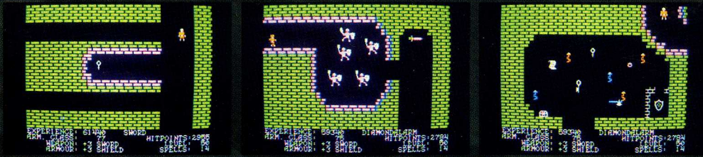
Scenes from Sword of Kadash .

W hat is a fantasy action adventure? It is a real-time animated action game that lets you develop your player's skill and power, like a fantasy game, and presents you with a large world in which to travel, complete with traps and puzzles, as in an adventure game.